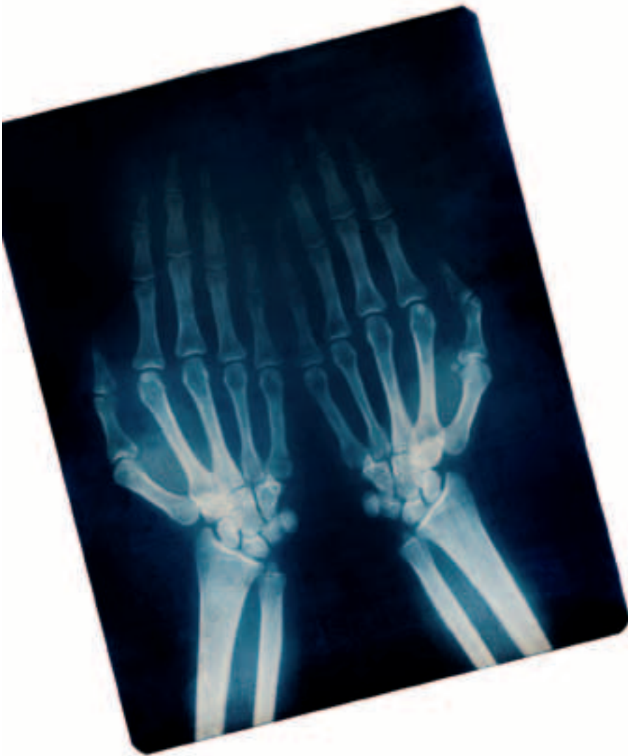
5 | Arwa Abouon, Hands Are Holy , 2008, digital print on Duratrans, 121.9 × 81.3 cm, collection of the artist.

Hands Are Holy consists of a white light box bearing an x-ray image of two long hands stretched out side by side (Fig. 5). The x-ray is positioned on an angle, reminiscent of the way they are often hung in medical settings. The position of the hands reenact another type of personal prayer Muslims perform after their daily salat ; the hands held together and forming a receptacle are brought up to the level of the chest or face in order to give thanks and/or to ask for forgiveness or help for oneself and others. Here the cupped hands are seen from above. Like all the works discussed here, the piece is no less visually effective for viewers unaware of the religious reference. The image of the hands, their large scale, the presence of light,