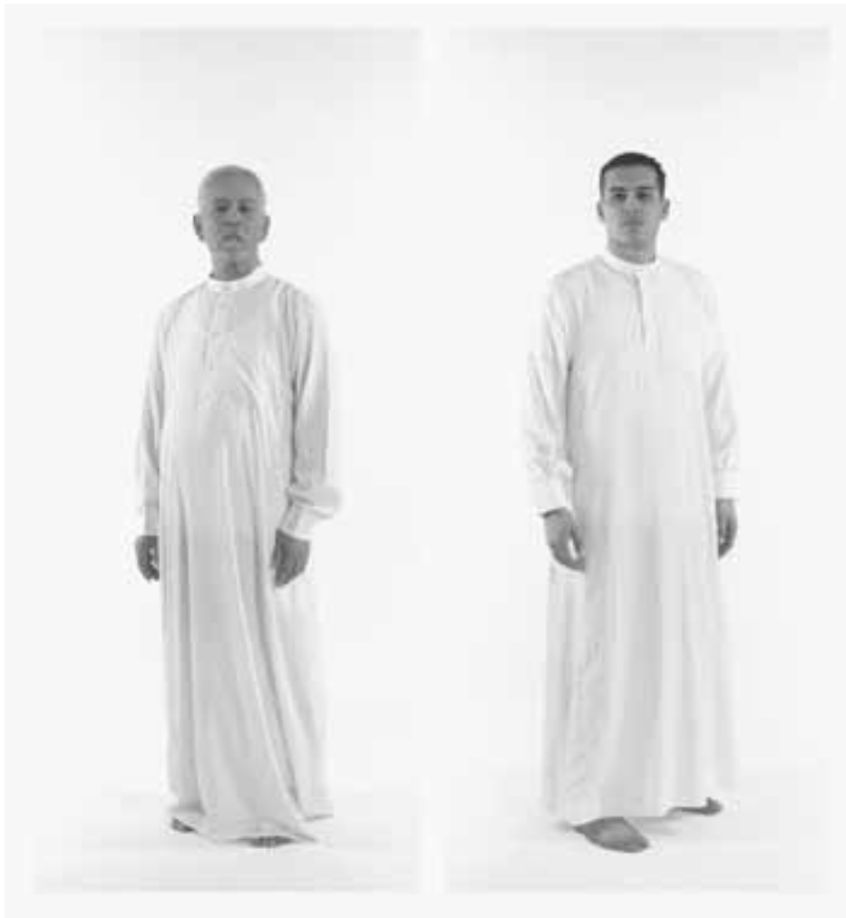
1 | Arwa Abouon, Untitled, Generation Series (Father and Son) , 2004, digital prints, 182.9 × 81.3 cm each, limited edition of ten, five in private collections. (Photo: Arwa Abouon)

picture plane. Upright with impeccable posture, their heads held high crown their shoulders as they look steadfastly at the viewer. Wearing crisp white jilbabs , both the young man on the right and the older man on the left are set against an all white background, a hint of shadow around the men's bare feet constituting the only indicator of space. The stark composition recalls the work of twentieth-century photographer Irving Penn, who first made the use of bare white backdrops as a method of enshrining subjects popular decades ago in his documentary work, but the visual effect is transformed in Abouon's piece because of the overall whiteness of the images: dissolving figure and ground, space becomes as important as what is more palpably visible. The figures' bodies, or rather the white jilbabs clothing them, seem to merge with